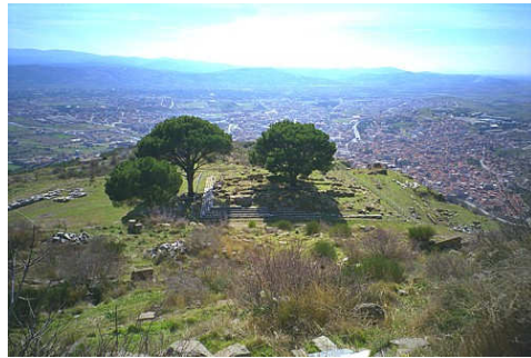
Pergamum: Altar to Zeus